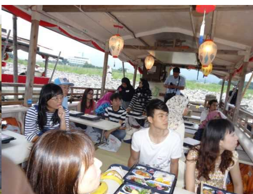
Traditional Culture Experience