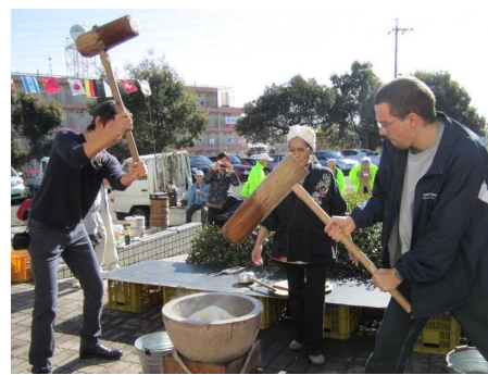
Traditional Culture Experience