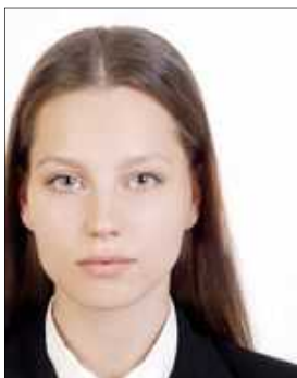
Image is not centered

■ Not meeting the requirement sizes and the standards