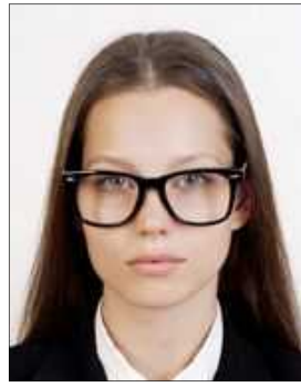
Too thick frames