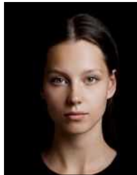
Vaguely-outlined image because of too dark behind