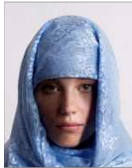
The part of the face is in shade because of head covering. (if there's no shadows and show the full face, head covering is allowed)