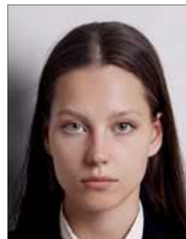
There's a shadow behind her head Not body front