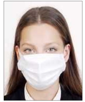
Hide one's face by a mask