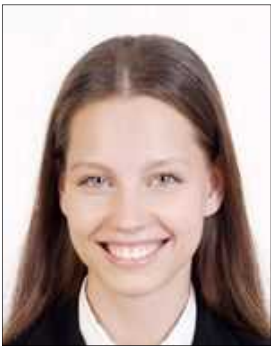
Mouth opens Looks different from normal face expression