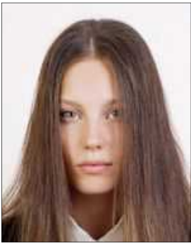
Hair covering eyes