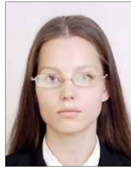
Reflection on lens