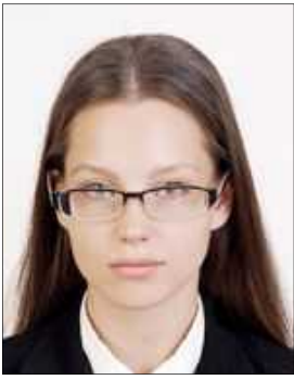
The frames across eyes