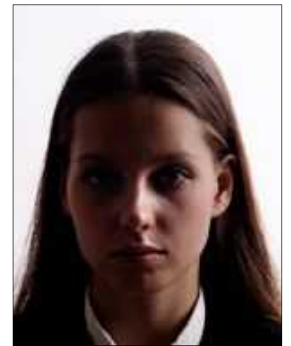
The part of the face is in shade