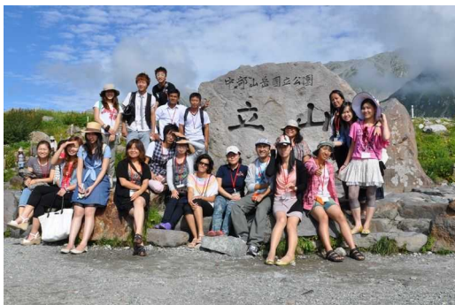
International Students Summer Trip

Monthly payment is to be made by an automatic money transfer from the bank account opened by the resident (*the bank designated by Gifu University: Kurono Branch of Juroku Bank).